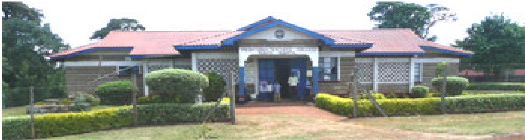
Kenya's Rubate Health Centre, 'The Clinic that Love Built,' serves nearly 60 patients a day thanks to SONKA generosity.

We will enjoy a special presentation on Sunday, August 14 during 10:00 worship. We have financially supported a clinic in Rubate, Kenya which is a partnership between SONKA churches and the Presbyterian Teachers College in Rubate. Together we built a clinic which has grown to hospital status. We will hear first-hand stories about the hospital from local youth who traveled there this summer. Please plan to attend and see how our mission dollars are helping others.